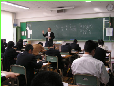
Careers in Education