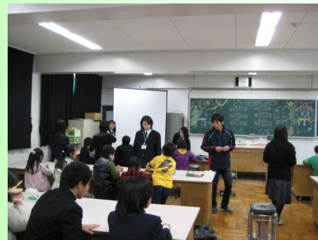
Home Economics Club

(Cultural Clubs:) Calligraphy • Home Economics • Tea Ceremony • Illustration Earth Science • Flower Arrangement • Art • Literature • Folk Song Agriculture • Dance