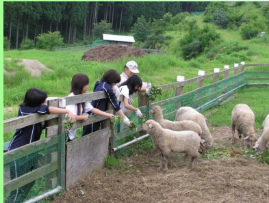
School Agricultural Lessons